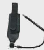
• 94ACC0133 Hand Strap (Included with purchase)