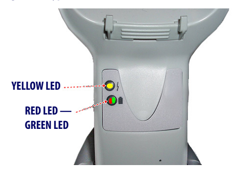
Figure 1. Gryphon I Base LEDs

The following table describes the significance of each LED: