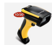
100-240V Power Supply

Model : 90ACC1883 Description : Power Supply, 12V DC, PG12-10P55