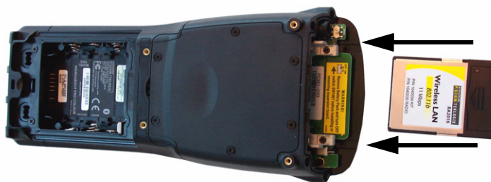
Figure 2 Inserting A CF Card