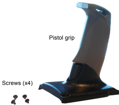
Figure 1-1 Pistol Grip Kit Contents

The Pistol Grip kit, model WA6103, is intended for use with WORKABOUT PRO3 and previous G2 units (models 7527C and 7527S) which have a backplate incorporating a switch.