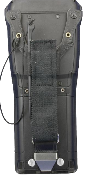
WA6025 Hand Strap with Mobile Stylus