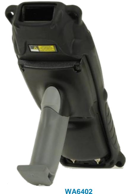
Rubber Boot for Long Extended Range Laser