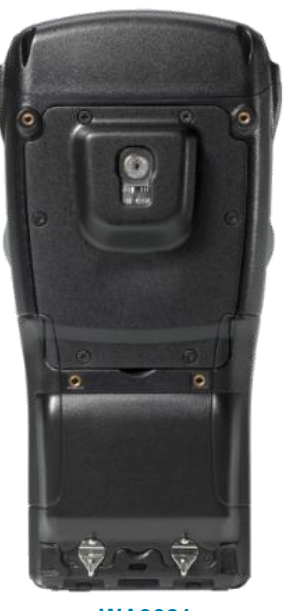
WA9021 8MP Camera Module