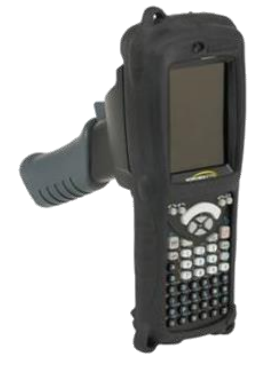
WA6400 Rubber Boot