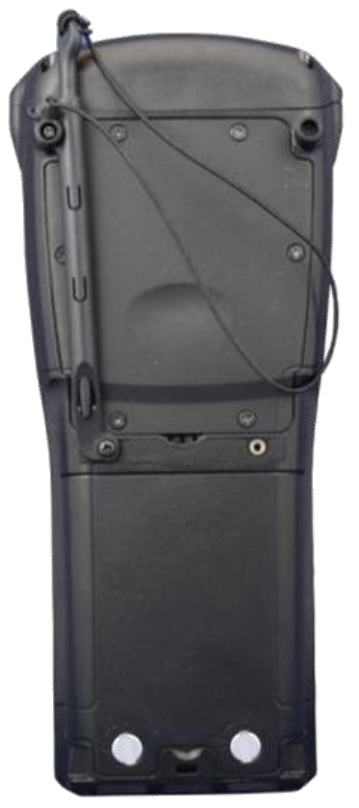
WA6310-G1 Mobile Stylus with Holder Kit