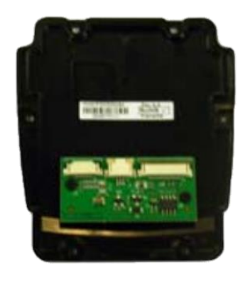
Inside Back Cover