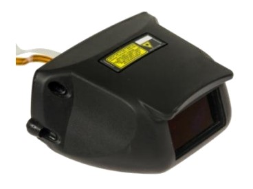
WA9022 1D Lorax Laser

For all other end-cap engines, a trigger board WA9302 is required ONLY when using the pistol grip.