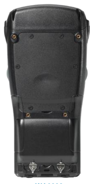
WA6208 Standard Blank Back-Cover