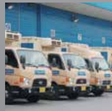
<Food & Beverage>